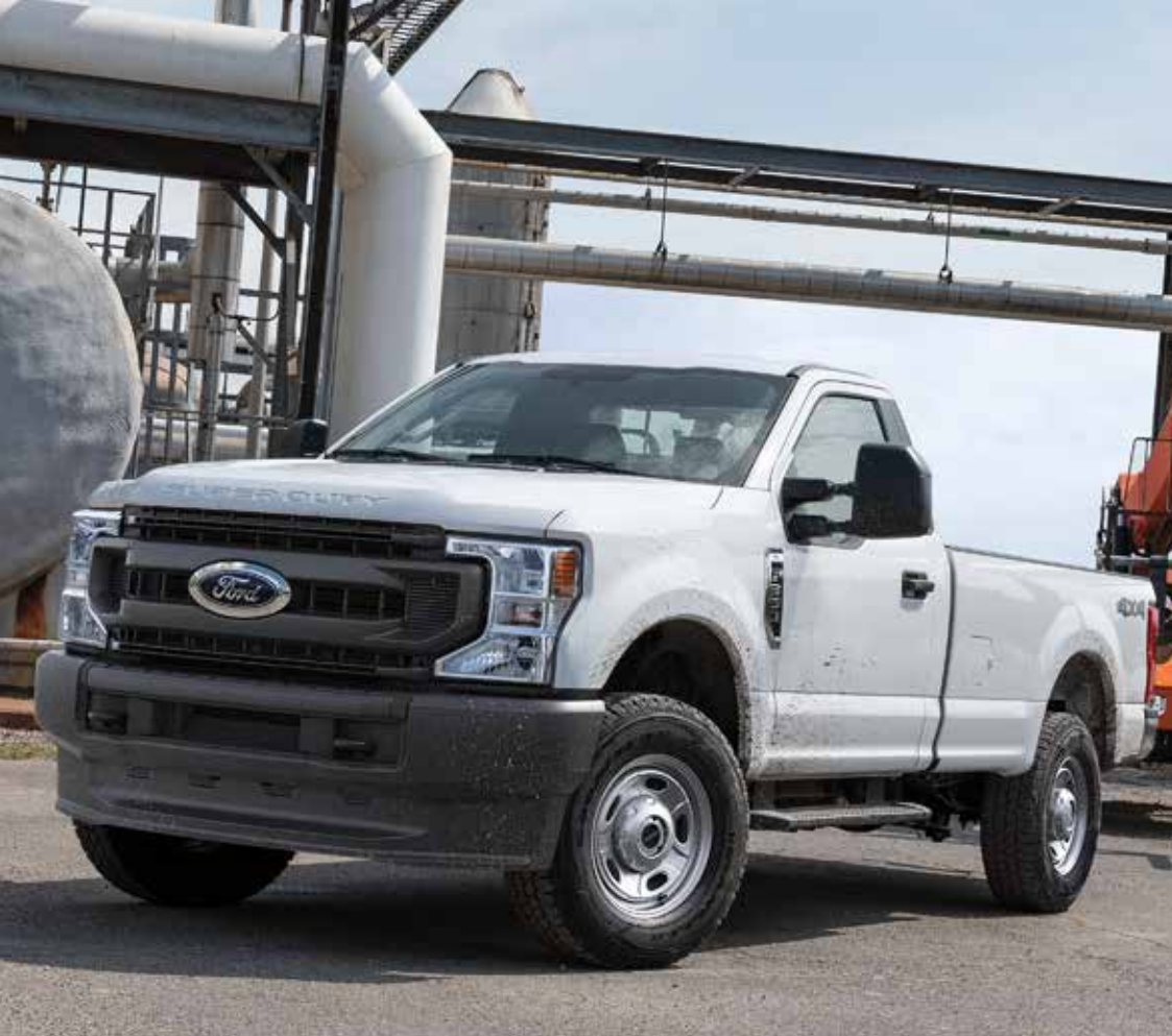
Super Duty F-350 XL Regular Cab 4x4 with 7.3L engine in Oxford White

2022 Super Duty Pickups reinforce the long tradition of F-Series toughness and continue to meet the needs of a multitude of commercial vocations, as well as personal use towing customers. Whether hauling construction materials, towing RVs or venturing off-road, these Built Ford Tough® trucks have the power and capability to make demanding jobs look easy. Super Duty Pickups are built to handle your toughest jobs with SuperCab and Crew Cab configurations in both 4x2 and 4x4 drivetrains, for added flexibility.