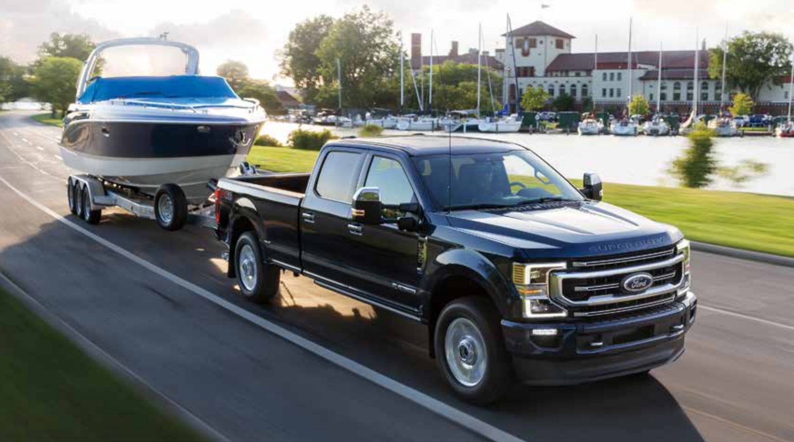
F-350 Platinum Crew Cab in Antimatter Blue Metallic