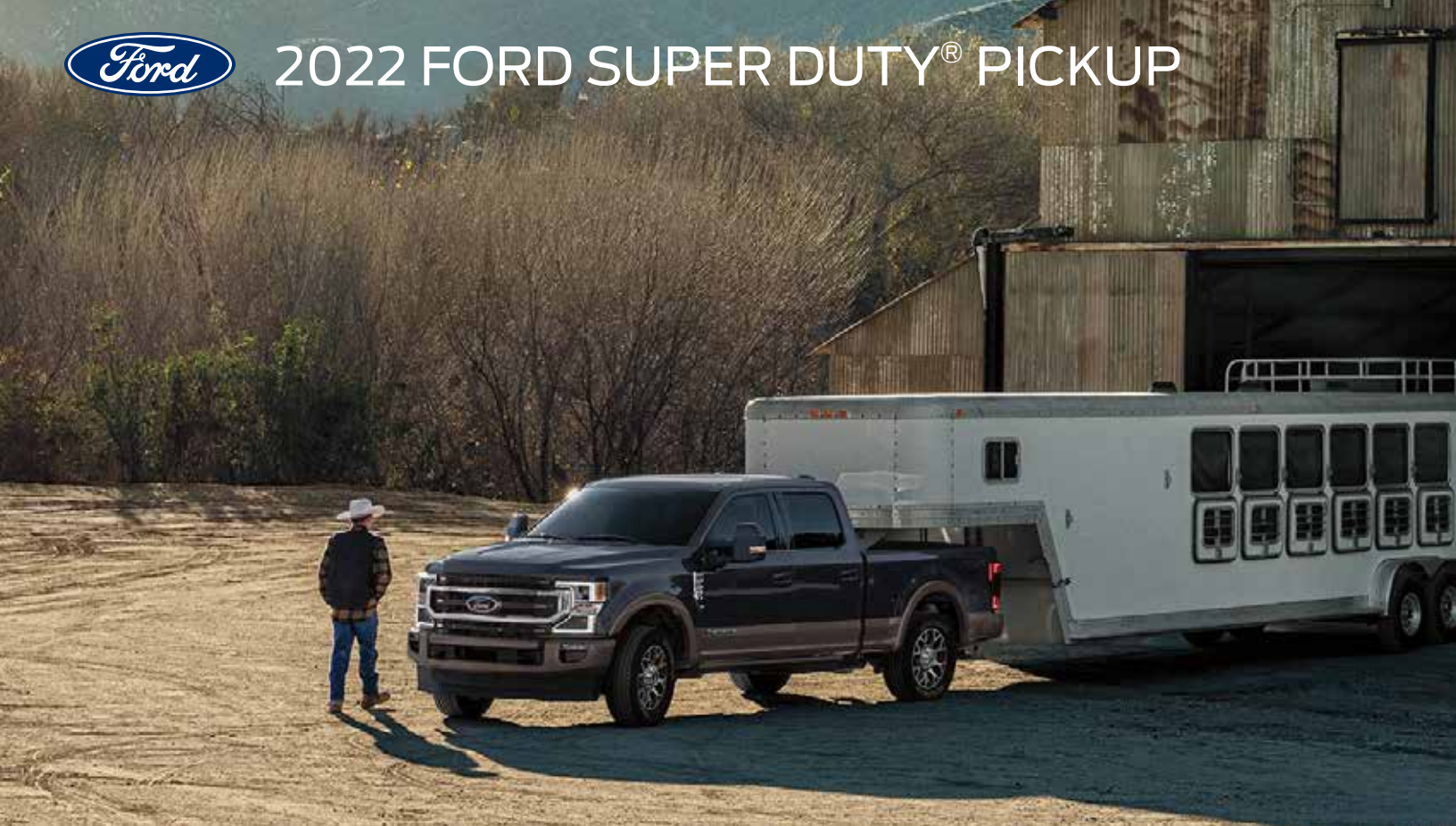
F-250 King Ranch® Crew Cab in Antimatter Blue Metallic Stone Gray Two-Tone