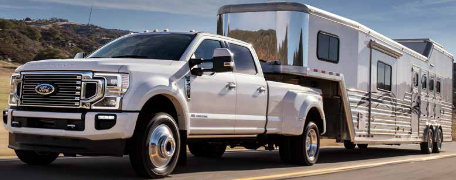
F-450 Limited Crew Cab 4x4 in Star White Metallic Tri-Coat with FX4 Package