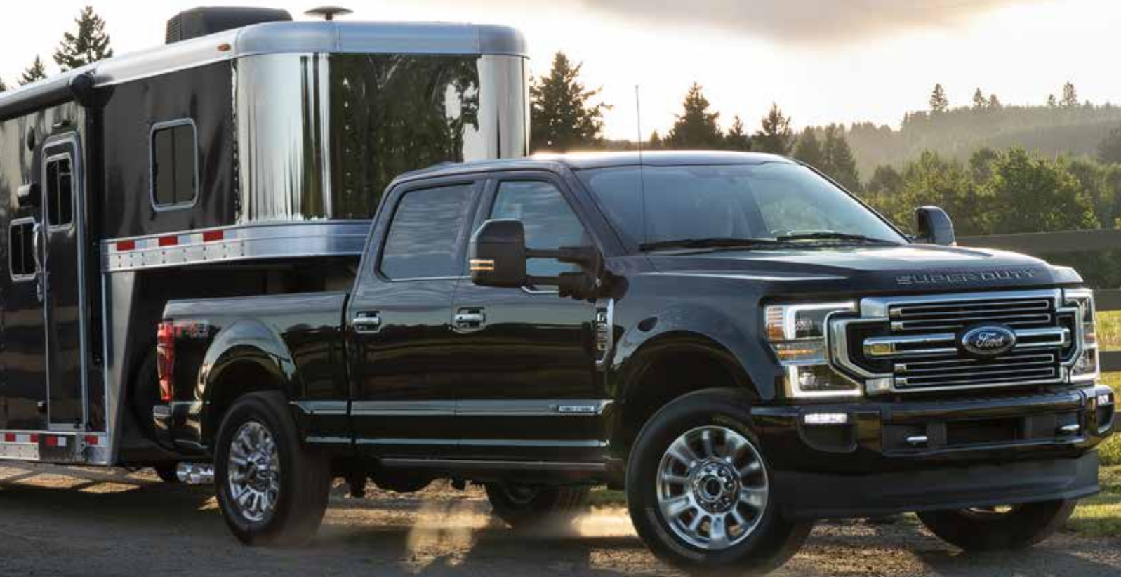
F-350 Limited Crew Cab 4x4 in Agate Black Metallic