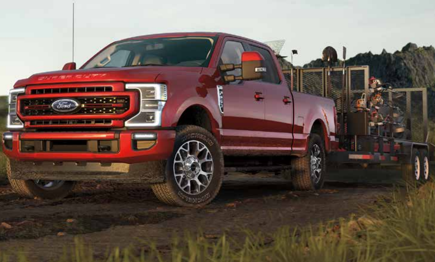
F-250 Lariat Sport Crew Cab 4x4 in Rapid Red Metallic Tinted Clearcoat